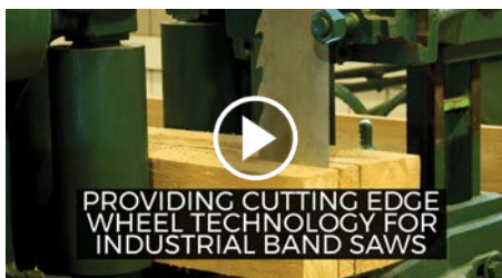
TB Wood's Band Saw Wheels