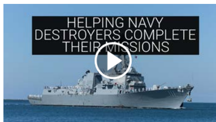
Ameridrives US Destroyer Couplings