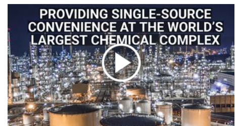
Altra Couplings for Sadara Facility